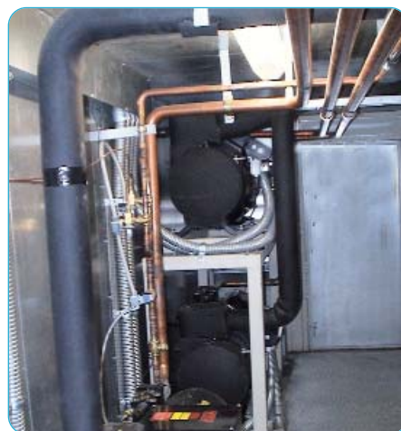
iPEC provides plenty of service space for Dx compressors and accessory maintenance. Co-locating equipment in a common location can save space and reduce maintenance costs.