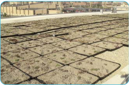
A "green" roof helps reduce building load and water runoff.