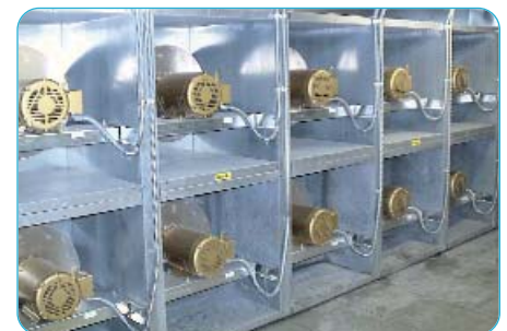
Because of its direct-drive design and smaller fan diameters, the FANWALL array has a lower acoustic impact, especially in the lower frequencies, which are more difficult to attenuate.