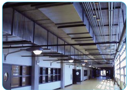
Wide hallways, bright floors, and a systematic layout of building materials gives a sense of order.