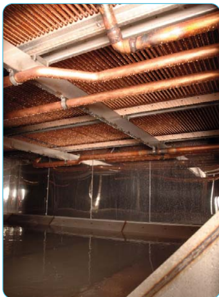
Evaporative-cooled condensers can reduce compressor energy consumption 20-40%, depending on location. Less condenser surface is required when compared to air-cooled condensers, which can reduce unit footprint as much as 50%.