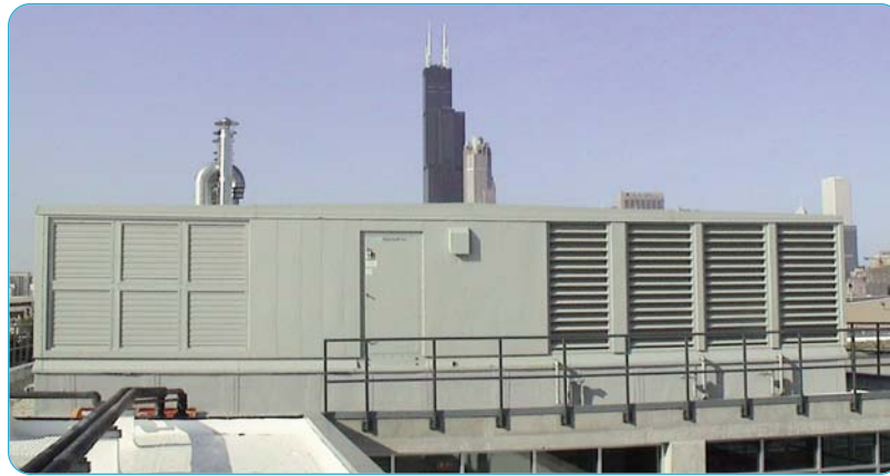
Mammoth® iPEC™ unit supplying HVAC to the Pacific Garden Mission.

“I believe you can’t be a responsible architect or mechanical engineer today and not build LEED® buildings.”