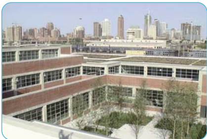
A terraced roof system aids in providing natural lighting.